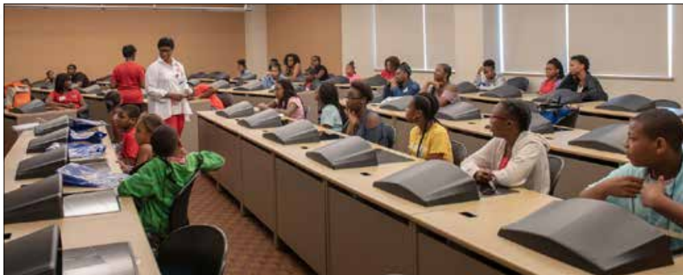
NBNA Summer Youth Institute