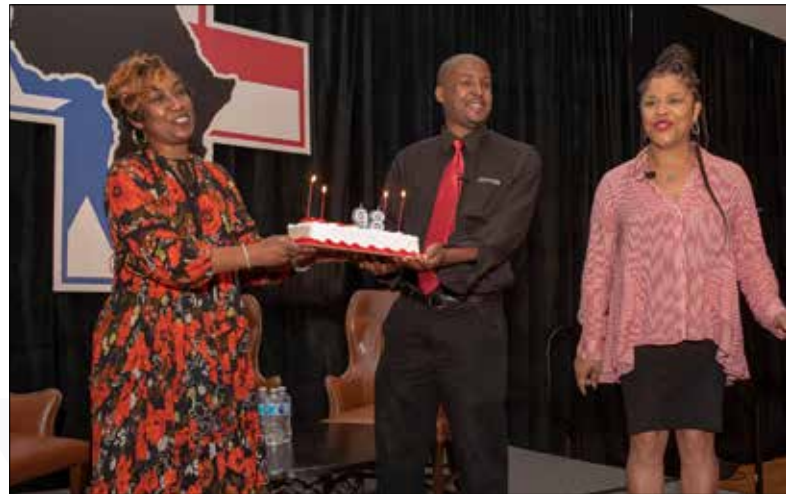
Susan G. Komen and NBNA Celebrates the birthday of Henrietta Lack with her family members.