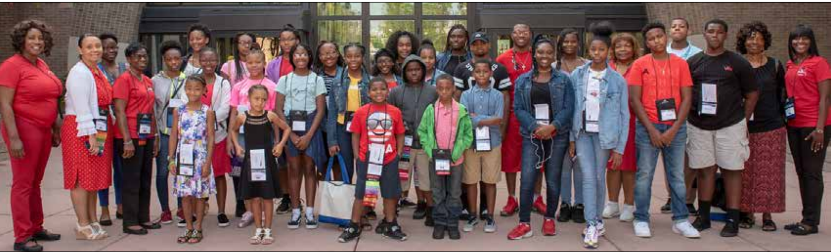
NBNA Summer Youth Institute 2018