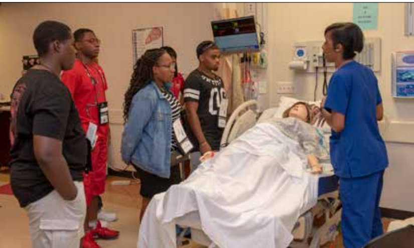
NBNA Summer Youth Institute at BJC College, Goldfarb School of Nursing.