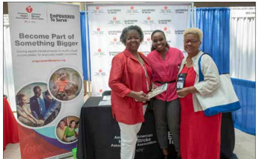
American Heart Association Booth