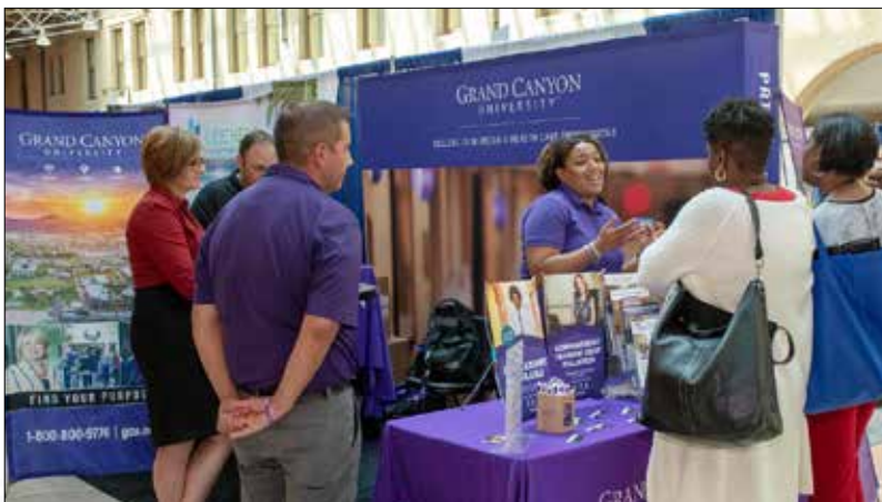
Grand Canyon University Booth