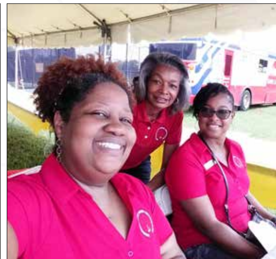
Party with a Purpose first-aid tent – BBNA members