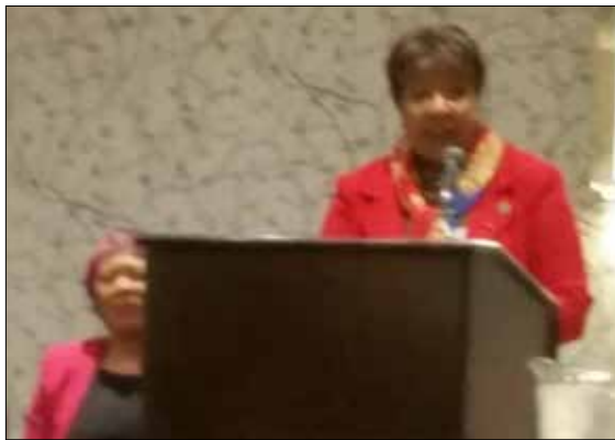
U.S. Representative Eddie Bernice Johnson (D-TX)