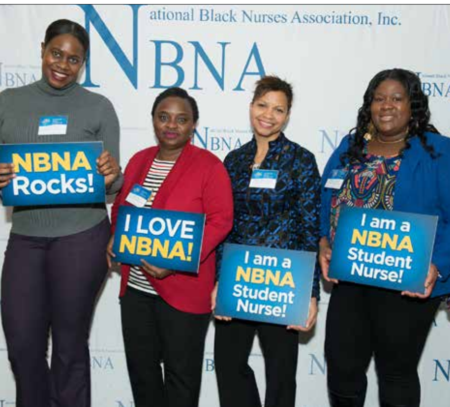
Nursing students sporting the NBNA signs