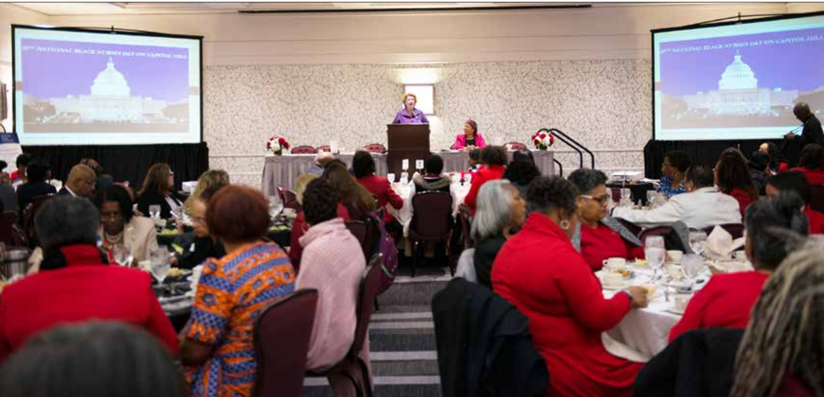
Senator Debbie Stabenow keynotes the luncheon at NBNA Day on Capitol Hill