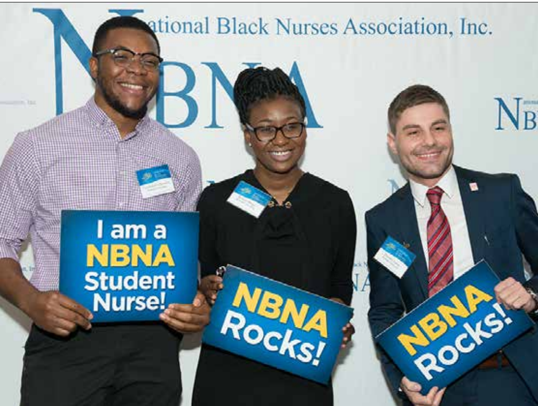
Nursing students attending NBNA Day on Capitol Hill