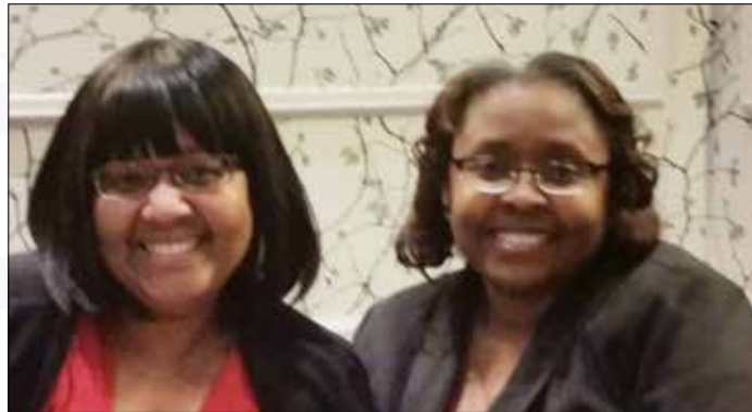
NBNA members attending NBNA Day on Capitol Hill