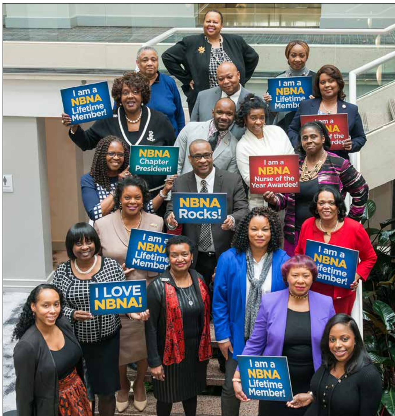
NBNA Board of Directors at Board Meeting on February 5, 2017.