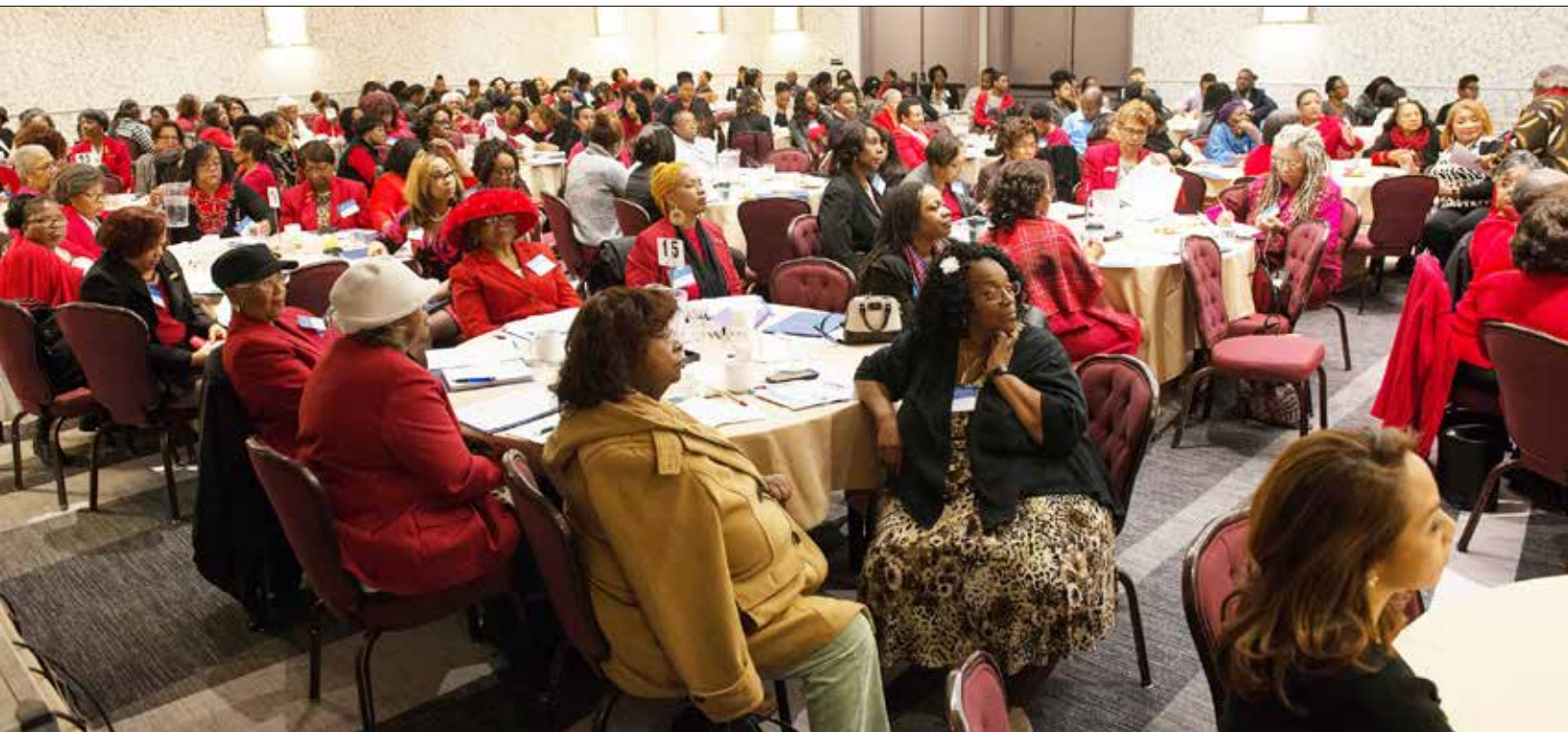
There is a full house at the NBNA Day on Capitol Hill