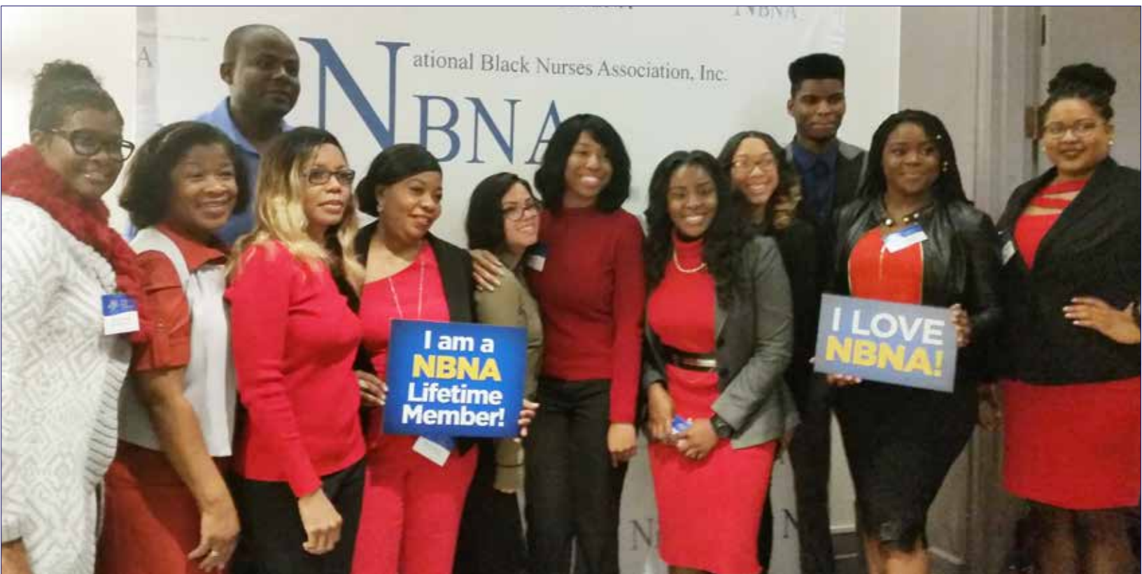
Local area nursing students attending NBNA Day on Capitol Hill