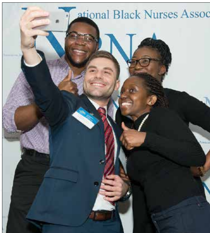
Nursing students taking selfies at the NBNA Day on Capitol Hill