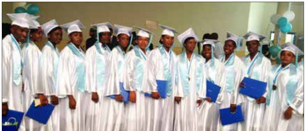
Pictured are graduates of the Haiti Nursing Foundation (HNF) and Faculté des Sciences Infirmières de l'Université Episcopale d'Haiti in Leogane (FSIL) program.