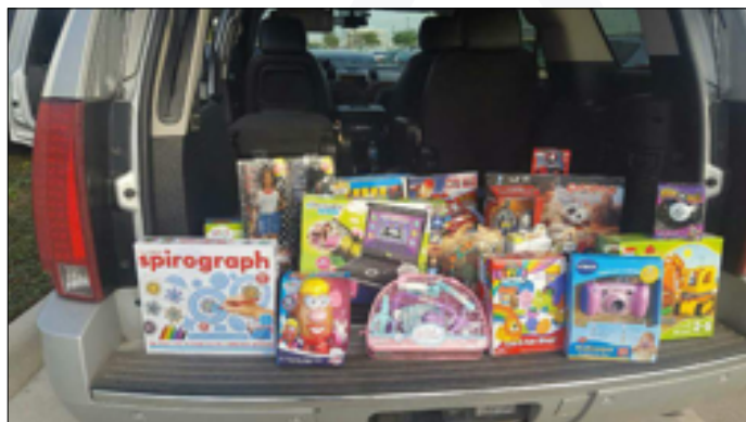
Donations to the Sickle Cell Anemia Holiday Toy Drive, December 10, 2016.