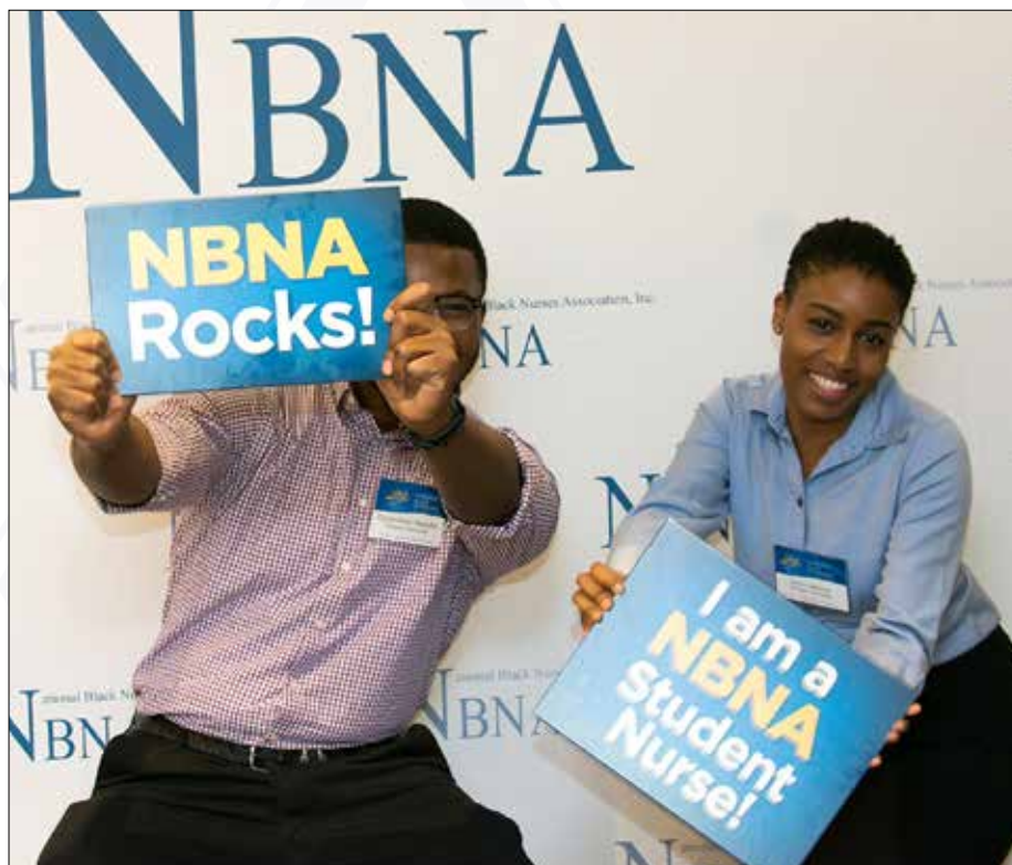
Nursing students think "NBNA Rocks!"