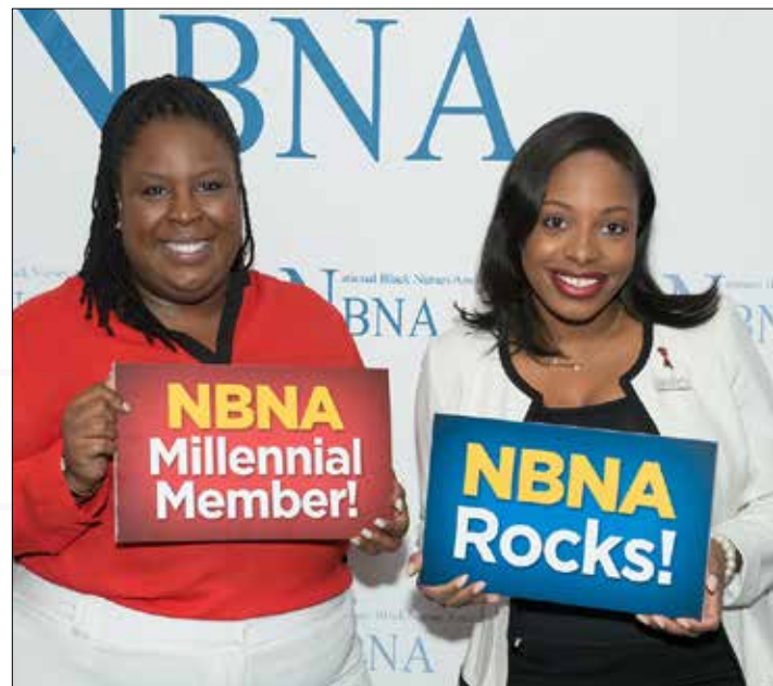
Nursing students attending NBNA Day on Capitol Hill