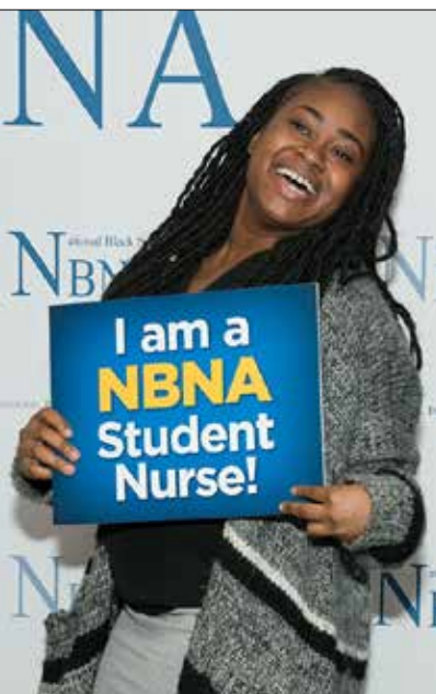
Local student nurse at NBNA Day on Capitol Hill