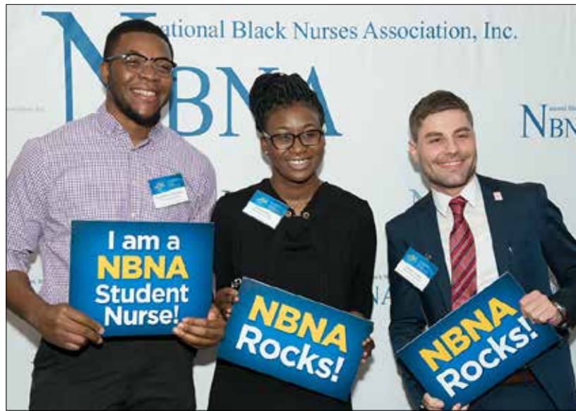
Nursing students attending NBNA Day on Capitol Hill