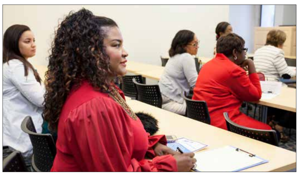
Attendees actively listening to the presentation.