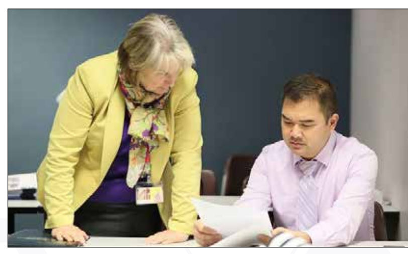
Attendees at the UMSON event