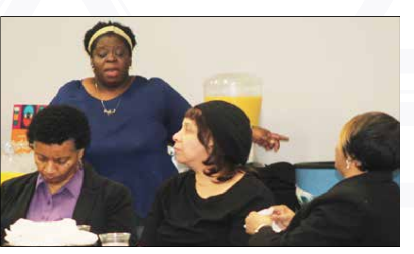
Participates waiting for program to start.