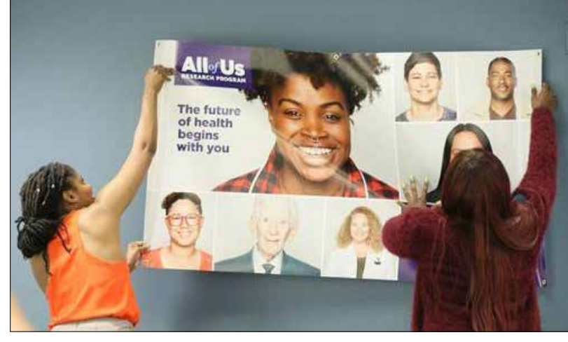
Setting up for the UMSON event