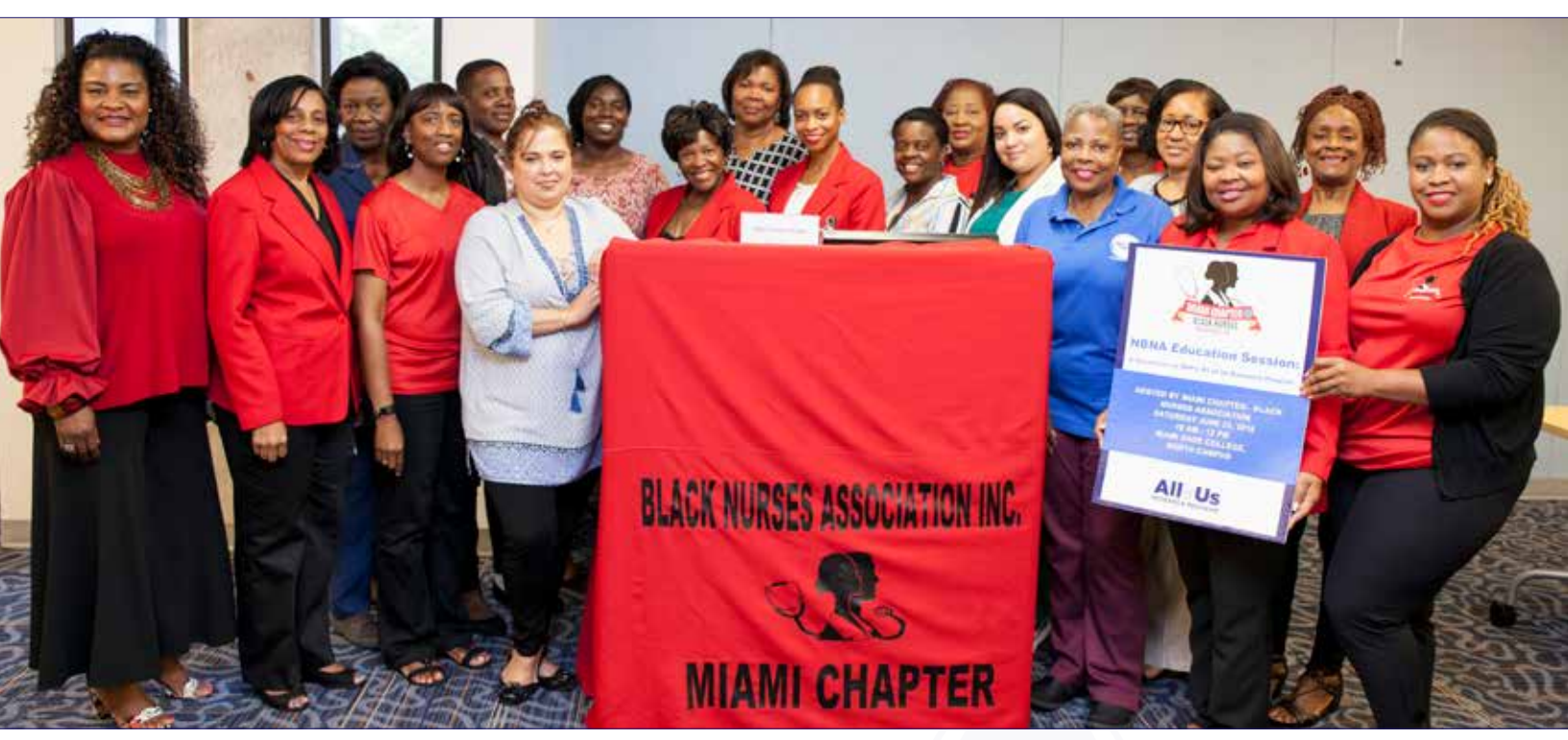
BNA Miami members and attendees at the end of the session.