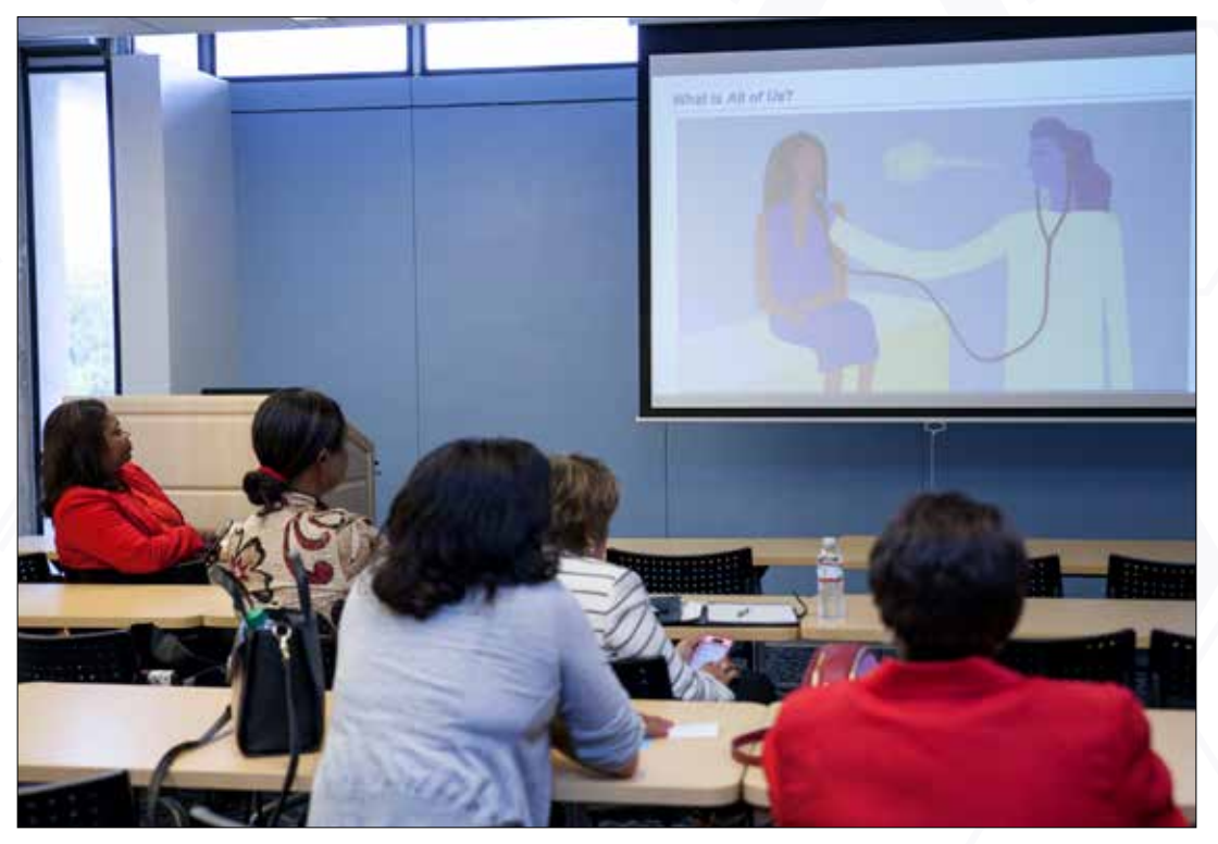
Attendees viewing a video about the All of Us Research Program.