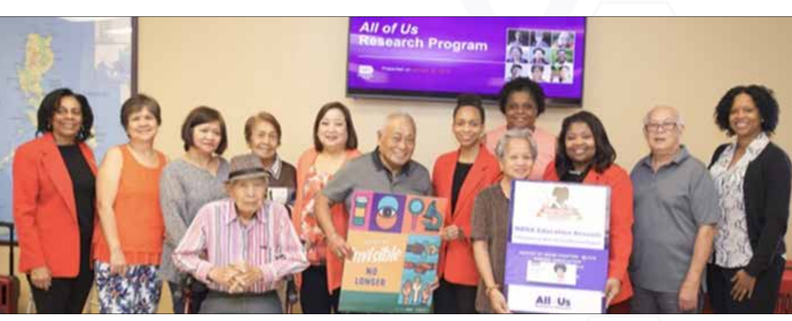
Miami BNA BOD Members along with Community Members at the NANAY Community Center.