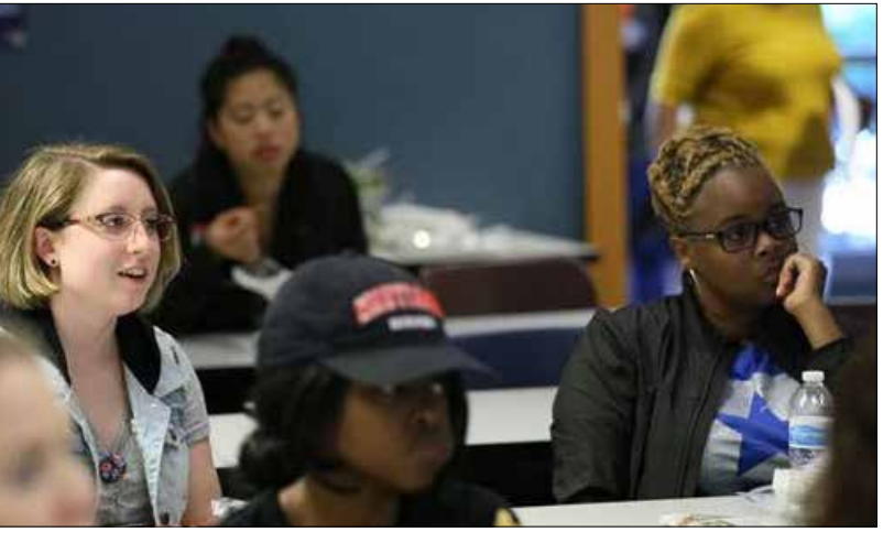
Attendees at the UMSON event