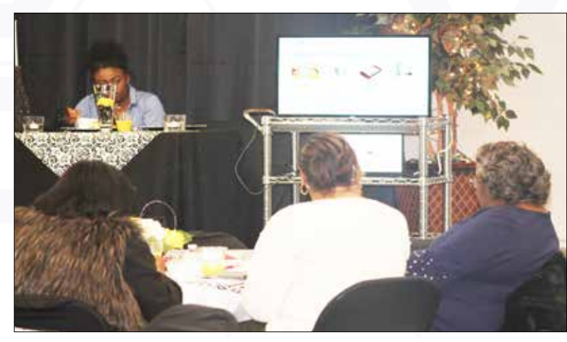
Video Presentation about All of Us Program.