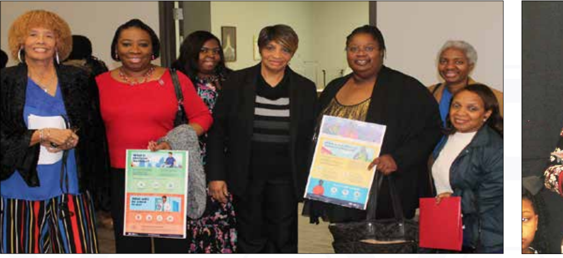
Individuals take time out to pose with members of BRBNA.