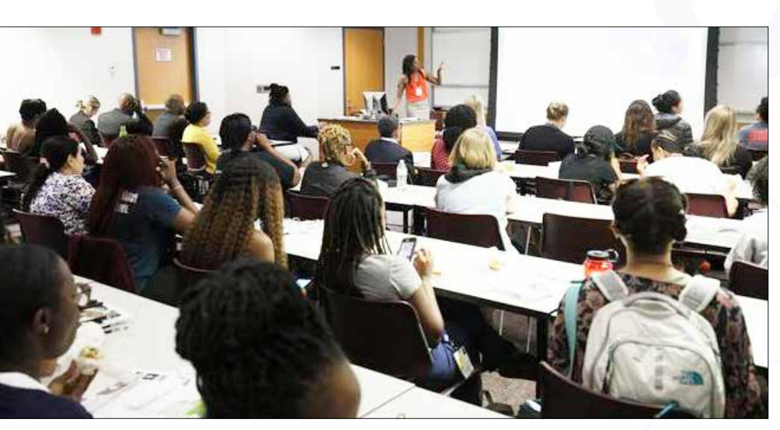
Attendees at the UMSON event