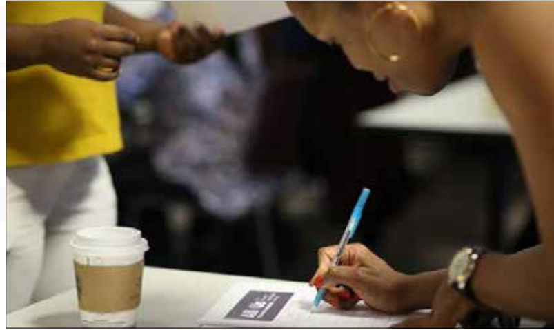
Signing in at the UMSON event