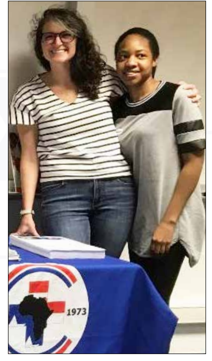
Theological Seminary students -Lutheran School of Theology