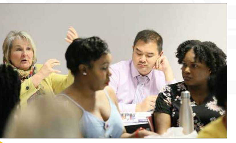
Attendees at the UMSON event