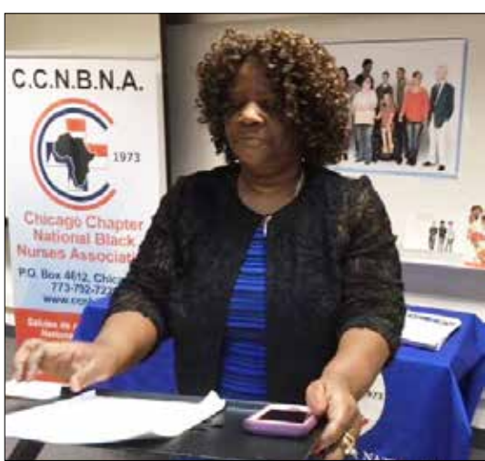
Live Power Point Presentation of All of Us Research Program