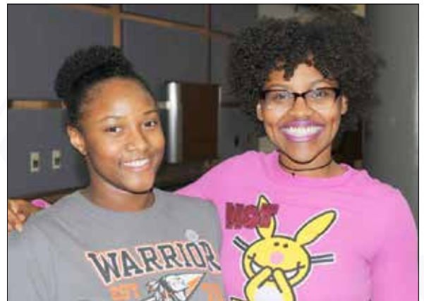
Prairie View A & M University Students