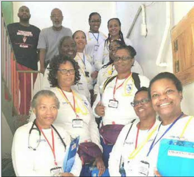
We stayed on the Hospital Beinfaisance campus in dorm rooms. Now we are ready to go volunteer!