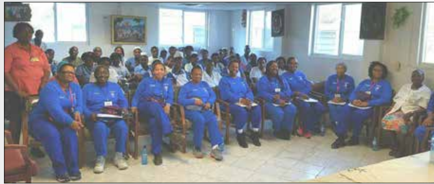
There were three different Haiti nursing schools that we helped with nursing instruction. We gathered everyday to teach the students and staff in a classroom setting. Everyone was willing and eager to learn.