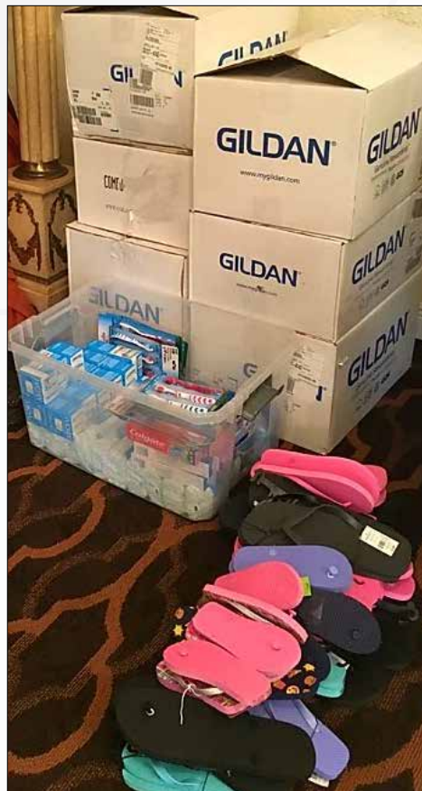
Miami BNA sending supplies to Texas!