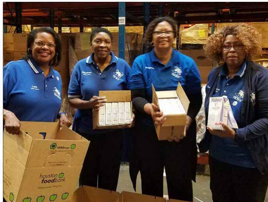
Working with a smile!!!