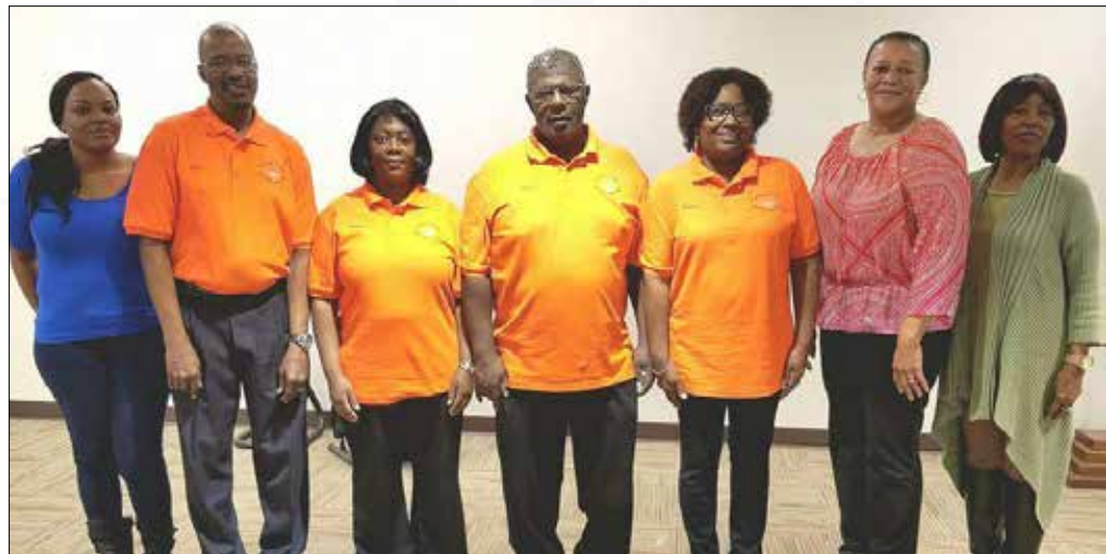
Central Texas Black Nurses Association