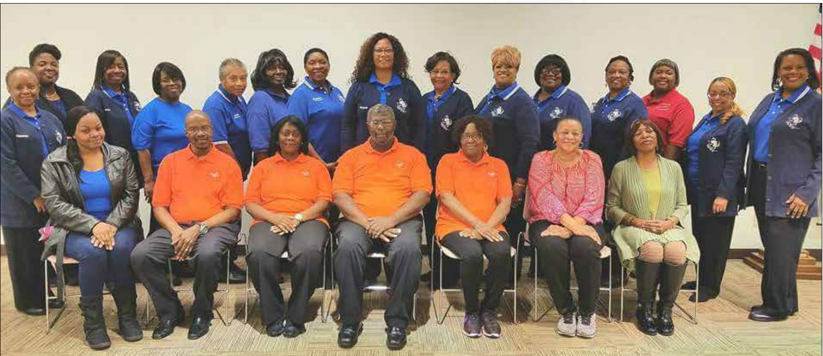
Central Texas BNA, Fort Bend County, and Tarrant County BNA at the Inaugural Meeting of Central Texas Black Nurses Association.