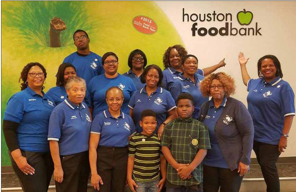
Fort Bend County BNA volunteering at the Houston Food Bank!