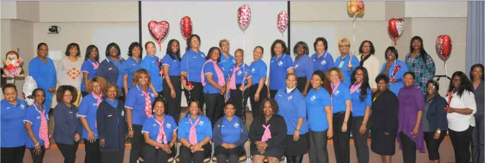
Fort Bend County BNA at the Local National Black Nurses Day