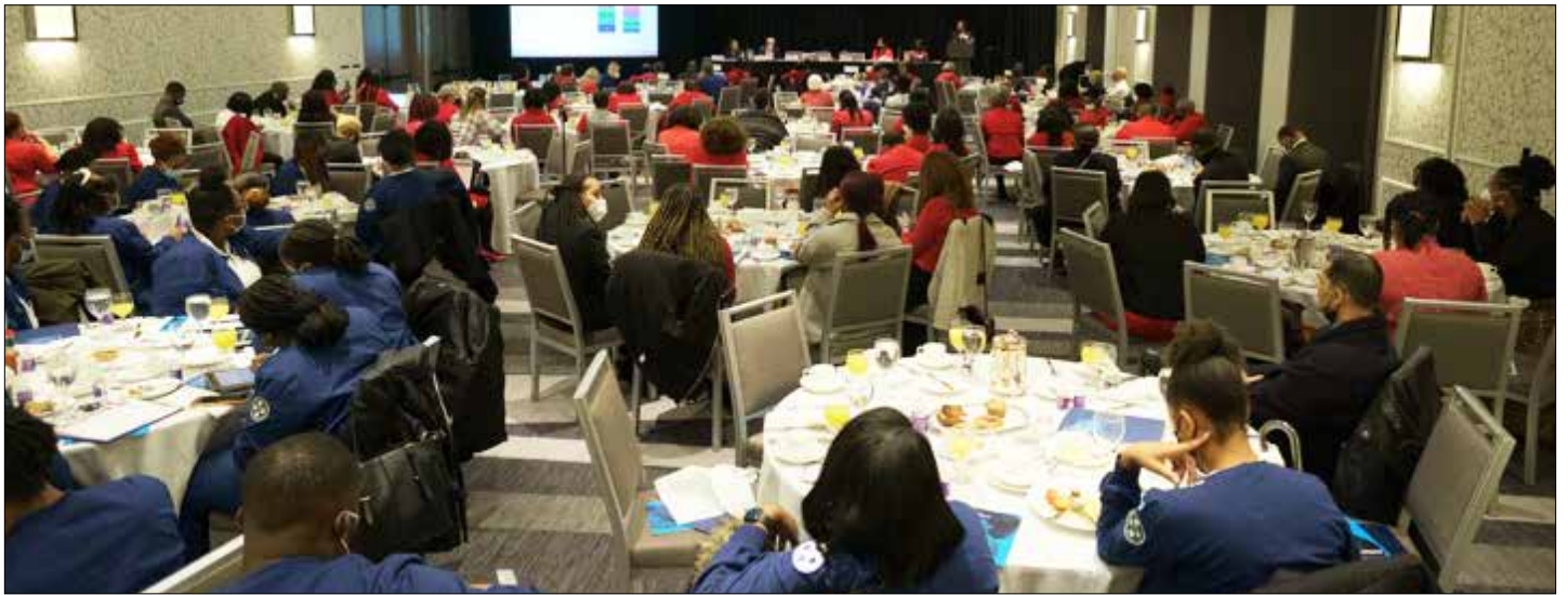
NBNA Day on Capitol Hill 2022 participants