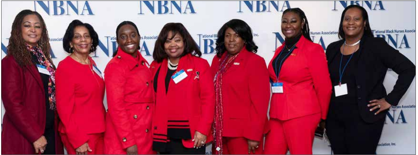
Florida NBNA Chapters