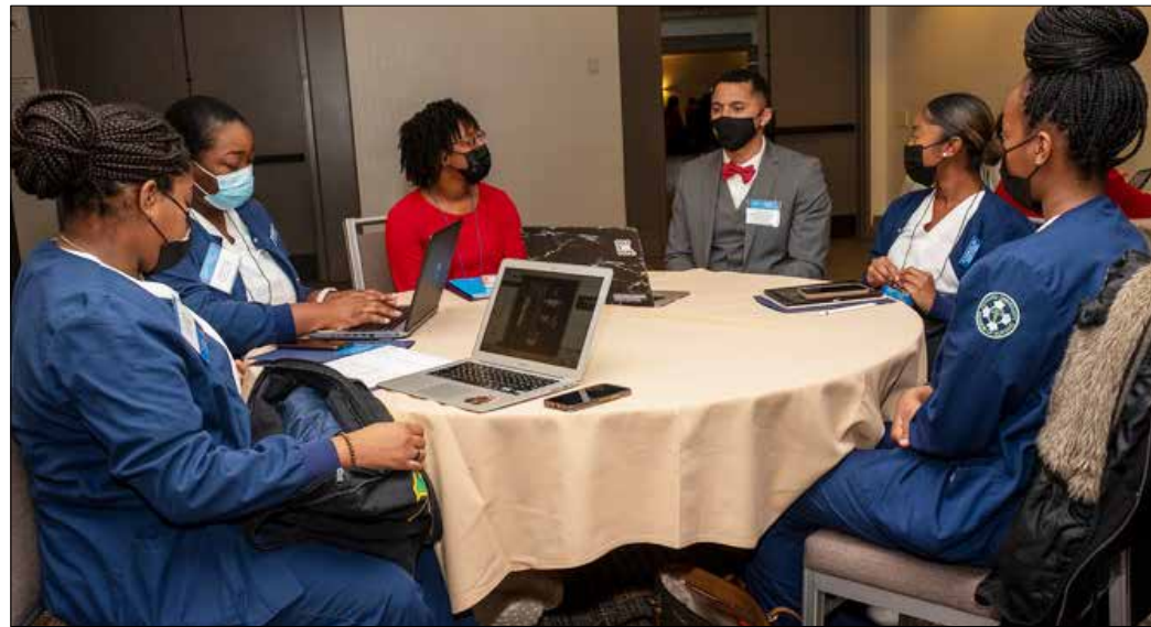
Capitol Hill Virtual Visits with Senators and Representatives