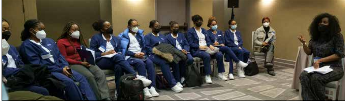
Tobacco-Free Kids College Listening Tour: Howard University, Johns Hopkins University, and Lincoln University Nursing Students