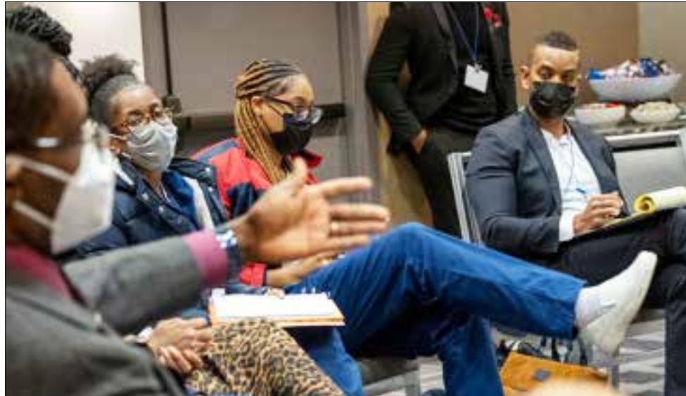
Tobacco-Free Kids College Listening Tour: Howard University and Lincoln University Students