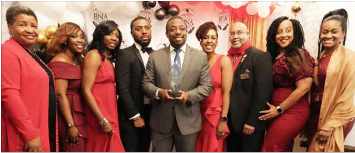
The GYNC-BNA Leadership Board