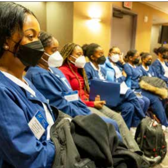
Howard University Students