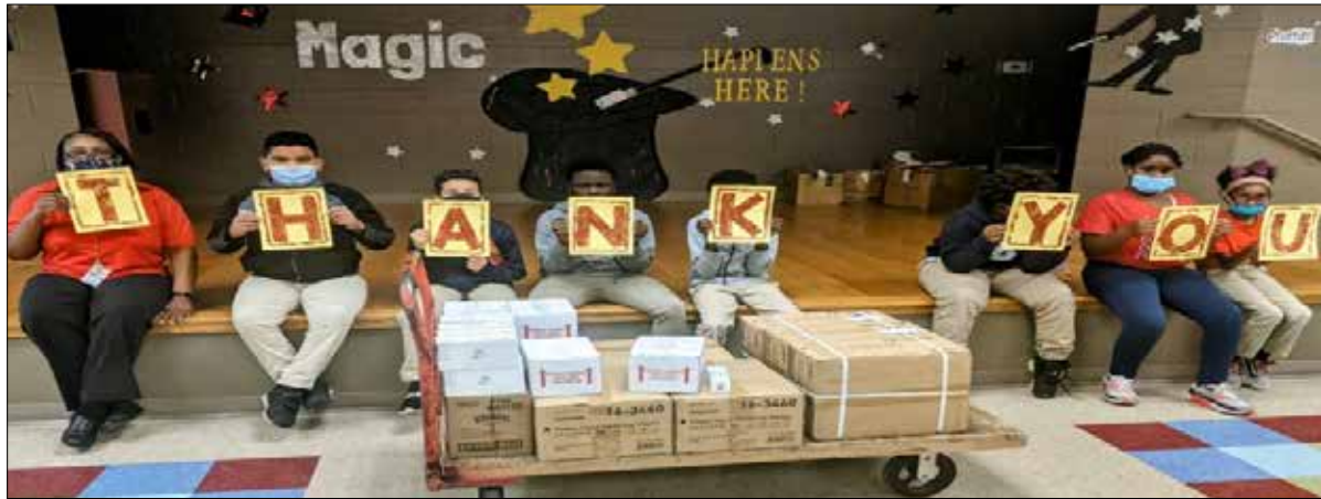
A BIG thank you to ABNA from Park Elementary School for COVID-19 prevention supplies.

The Acadiana Chapter of the National Black Nurses Association (ABNA) is fortunate to have received funding from NBNA to provide health supplies to At-risk schools located in the ABNA chapter region with high COVID case rates. ABNA identified 20 schools within Acadiana's seven (7) parish region that would benefit from the health-related supplies. As of February 9, 2022, COVID cases from these 7 parishes ranged from 39 to 242 new cases per week with 5 weekly deaths reported. No data has been provided to substantiate age related cases and deaths.