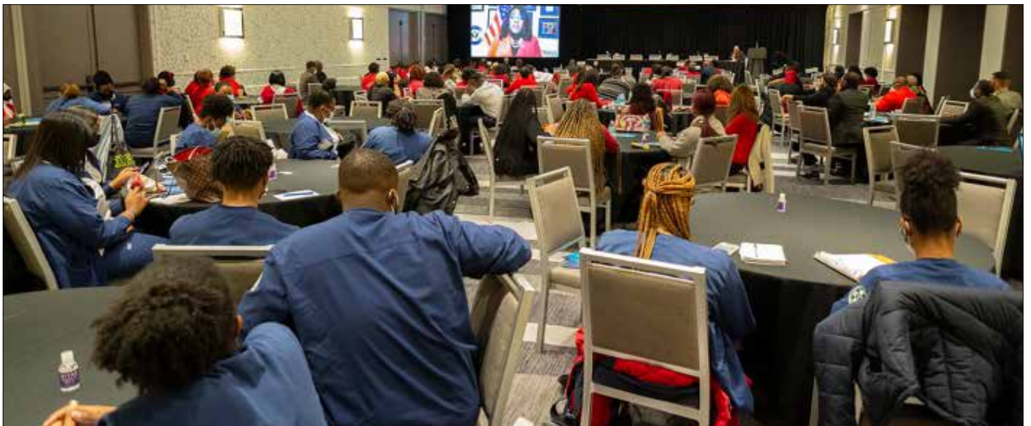
NBNA Day on Capitol Hill 2022 participants listening to greeting from Members of Congress