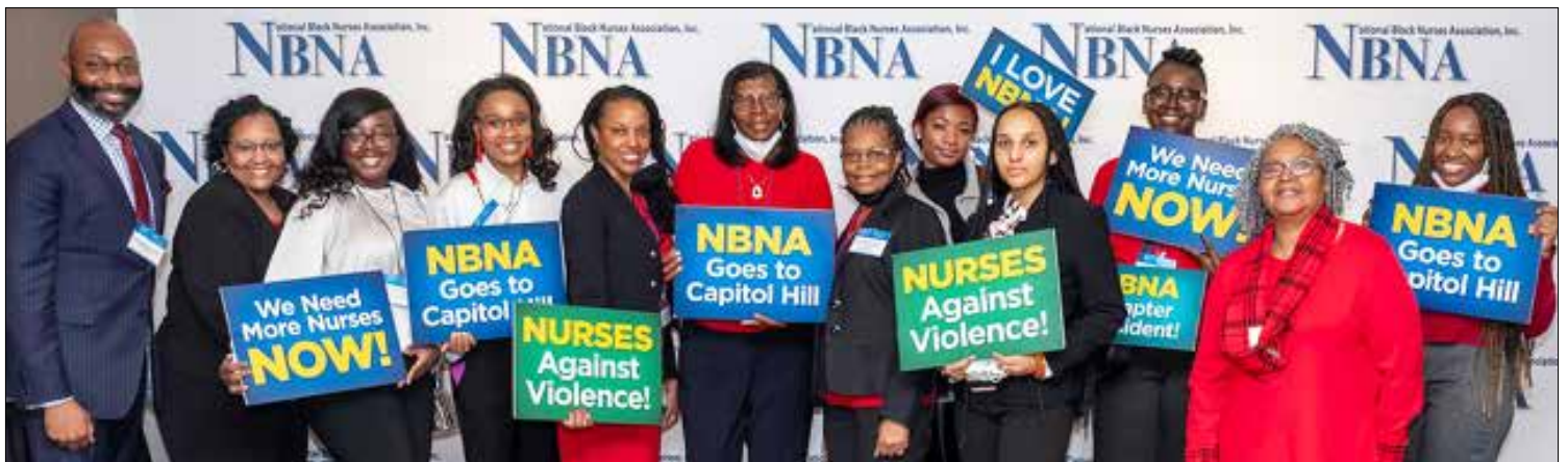
Southeastern Pennsylvania area Black Nurses Association members