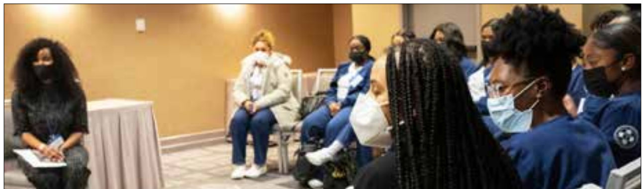
Tobacco-Free Kids College Listening Tour: Howard University, Johns Hopkins University, and Lincoln University Nursing Students