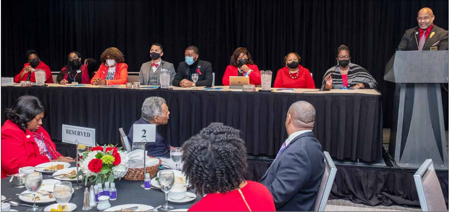
NBNA Chapter President speaks on Chapter Programs