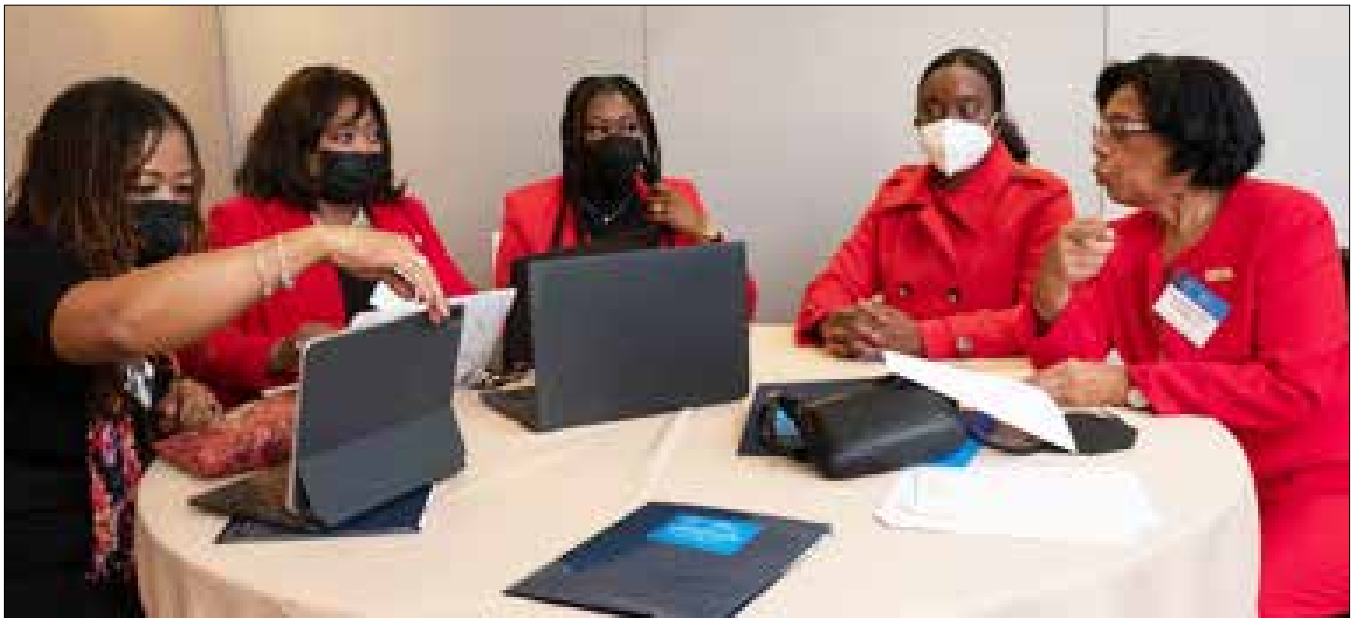
Florida Chapters virtual visit with members of Congress