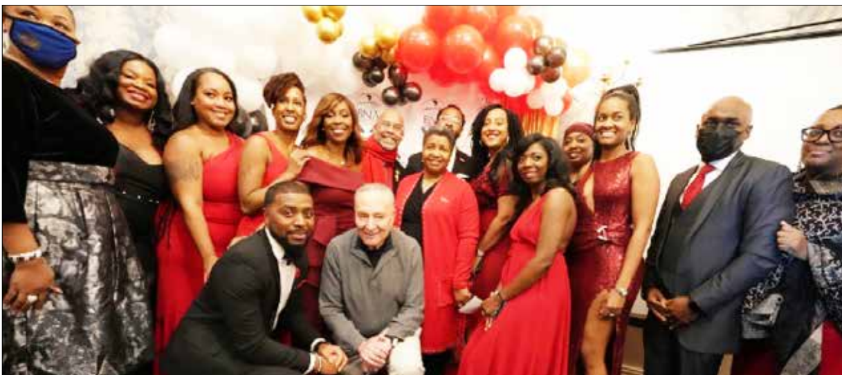
The GNYC-BNA Leadership Board with US Senate Majority Leader Charles E. Schumer.