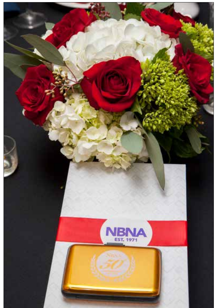
Corporate Roundtable Setting