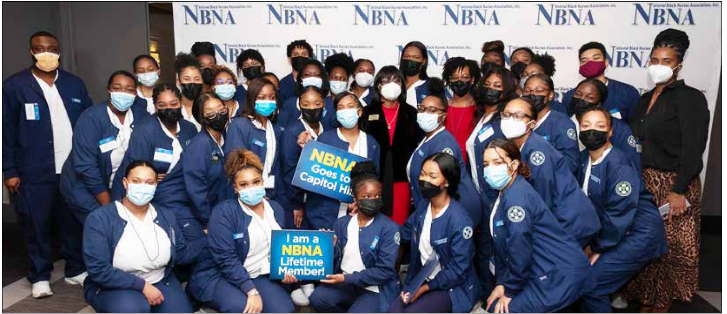
Howard University Was In The House