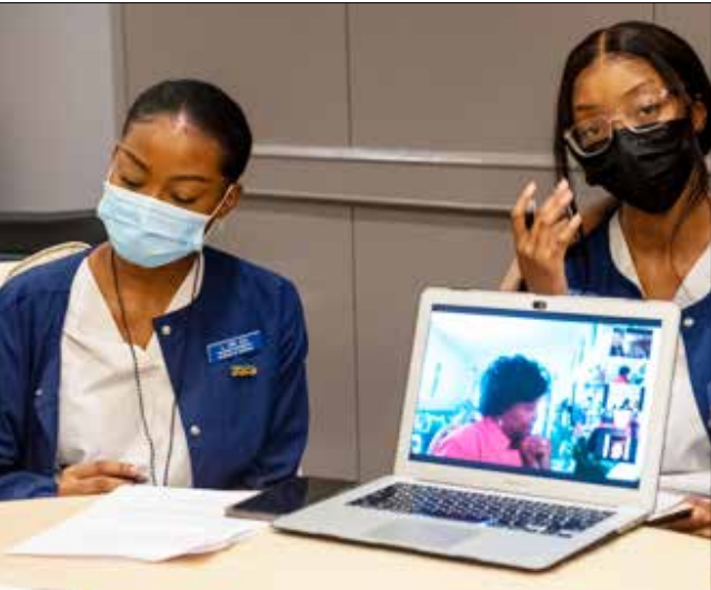
Tobacco-Free Kids College Listening Tour: Howard University Nursing Students