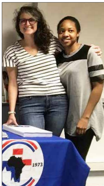
Theological Seminary students - Lutheran School of Theology