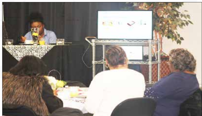
Video Presentation about All of Us Program.