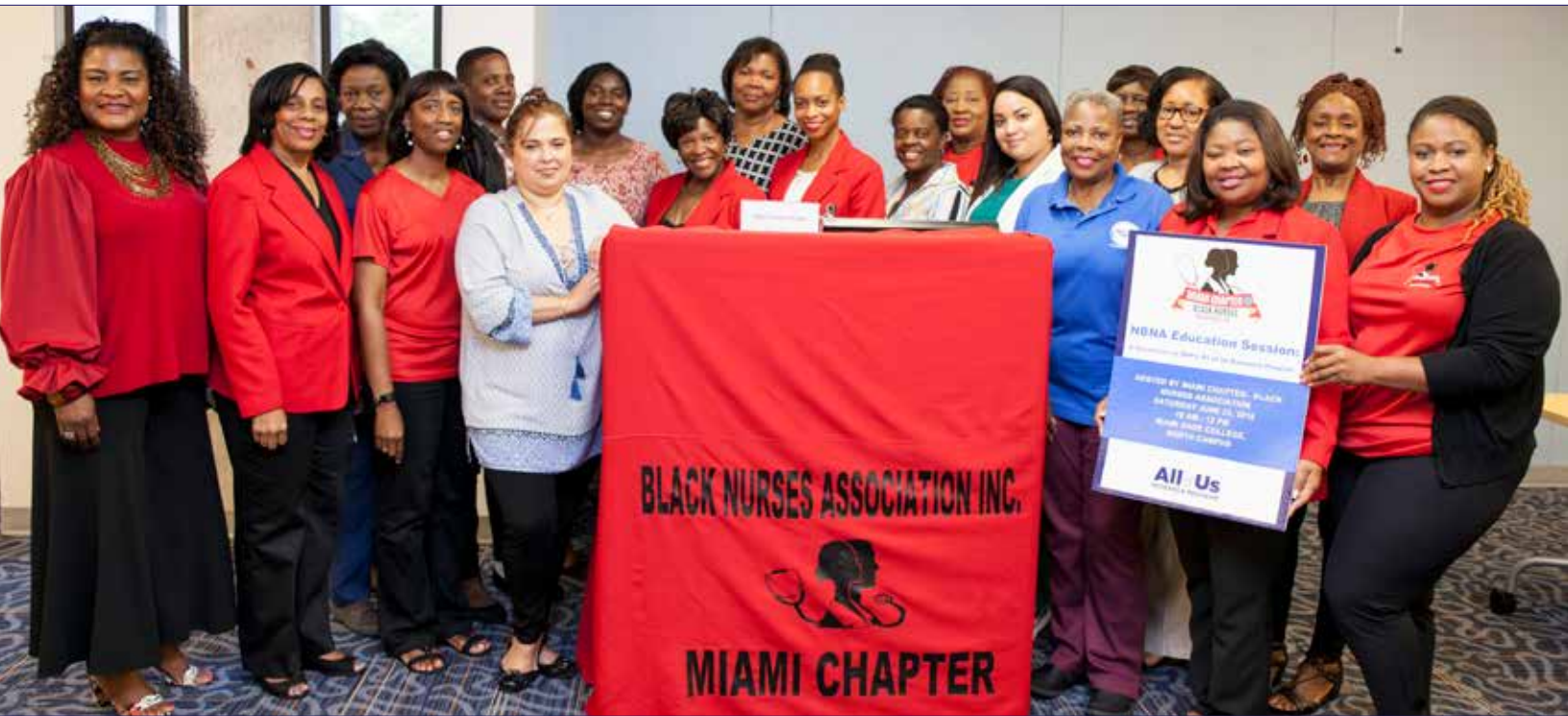
BNA Miami members and attendees at the end of the session.