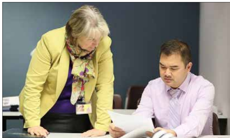
Attendees at the UMSON event