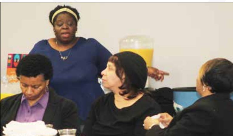
Participates waiting for program to start.