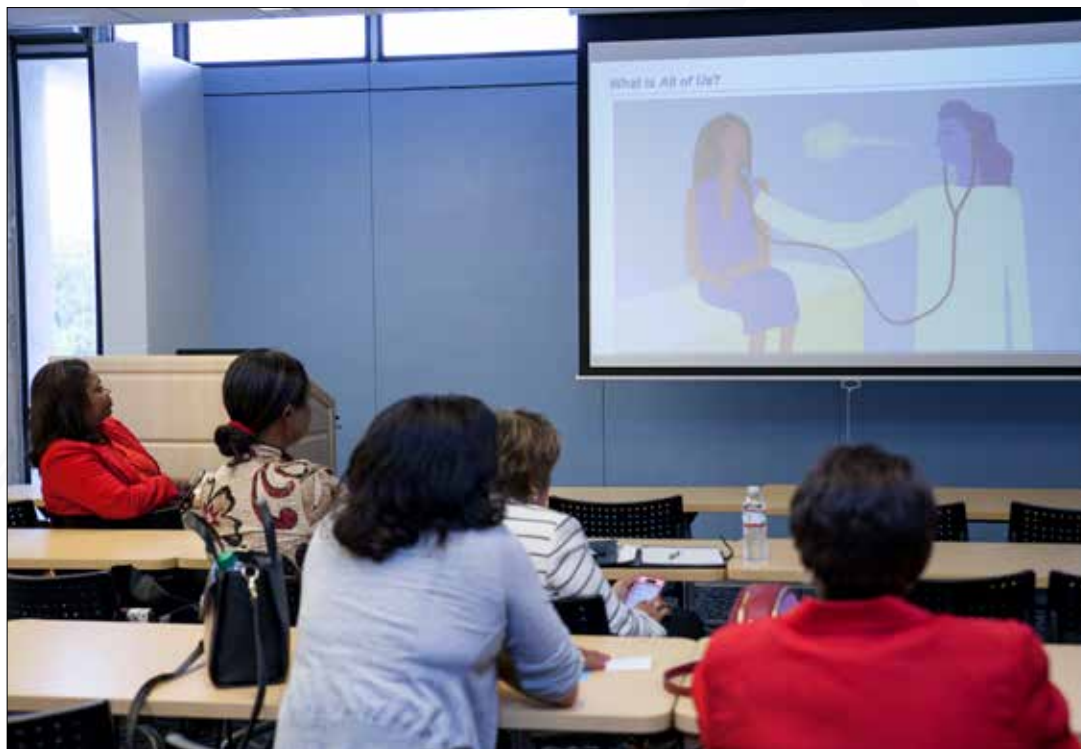
Attendees viewing a video about the All of Us Research Program.