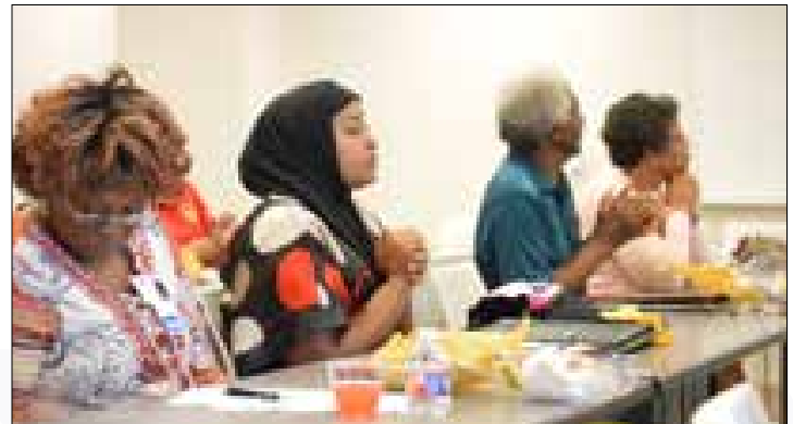
“All of Us” Educational Session Participants New Orleans Black Nurses Association (NOBNA)