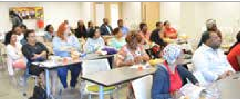
“All of Us” Educational Session Participants New Orleans Black Nurses Association (NOBNA)