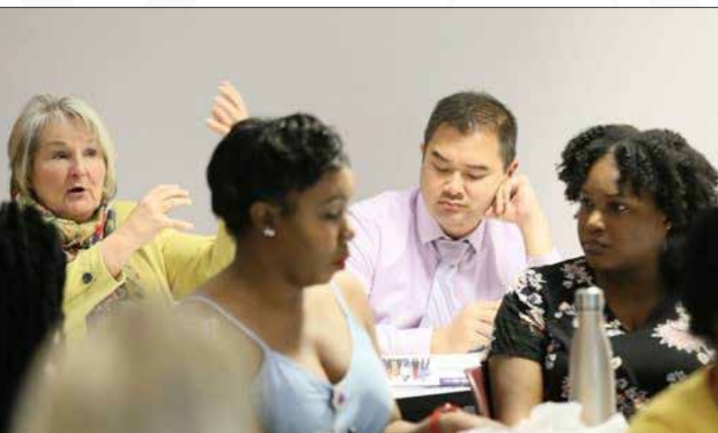
Attendees at the UMSON event