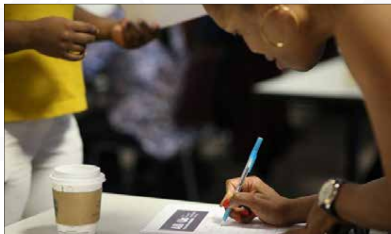
Signing in at the UMSON event