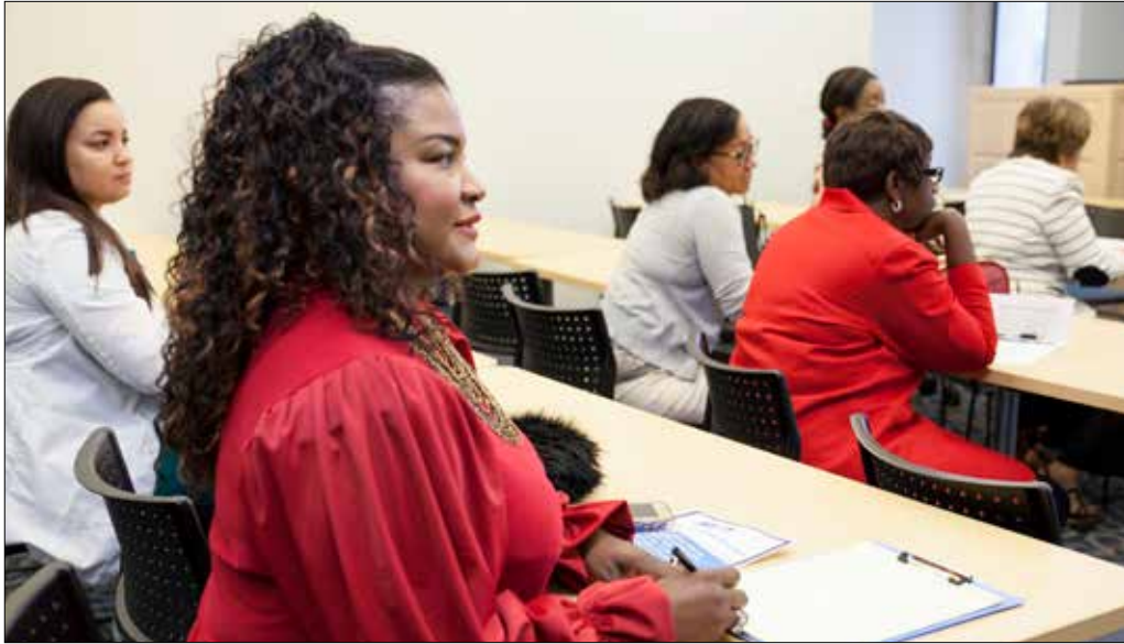
Attendees actively listening to the presentation.