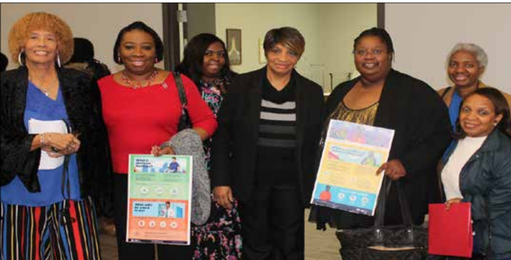
Individuals take time out to pose with members of BRBNA.