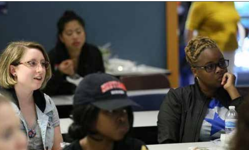
Attendees at the UMSON event