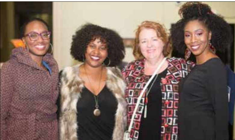
Nurse attendees ready to learn.