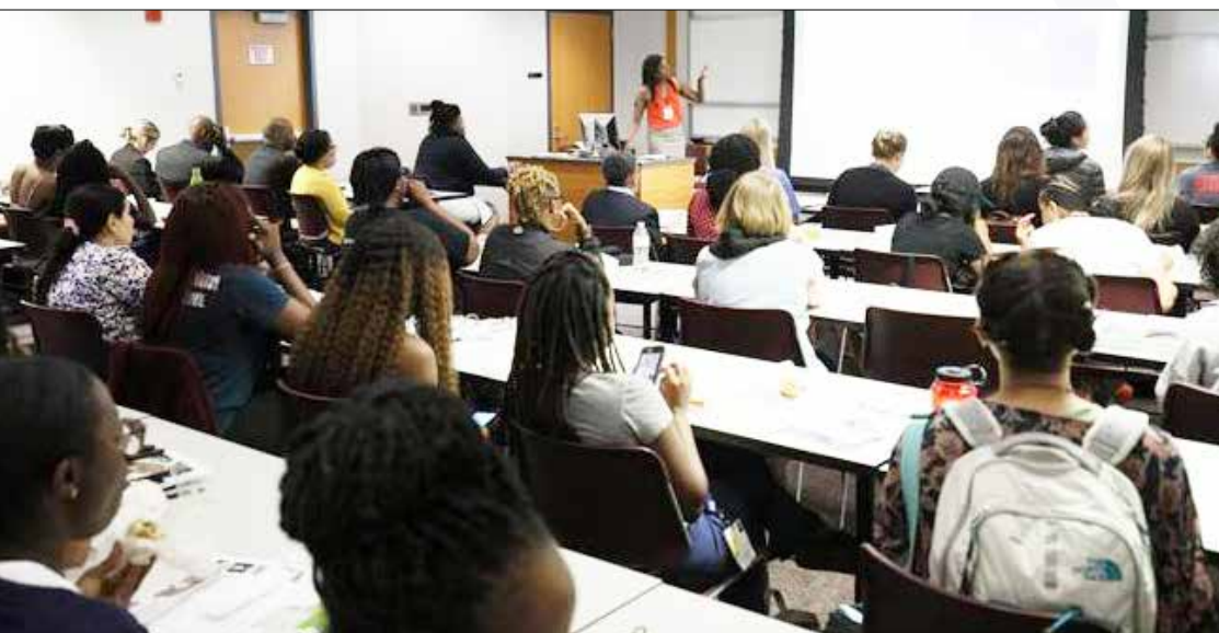
Attendees at the UMSON event