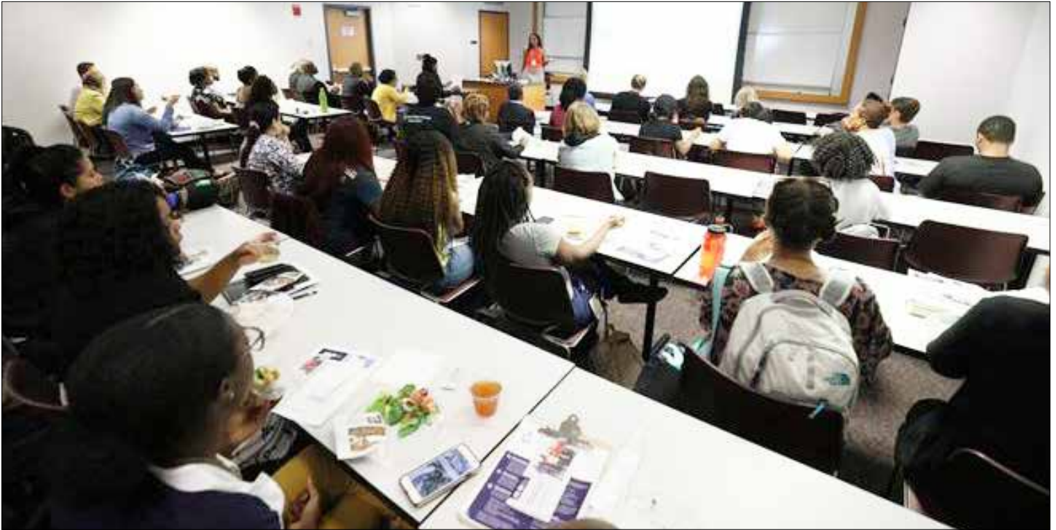
Attendees at the UMSON event