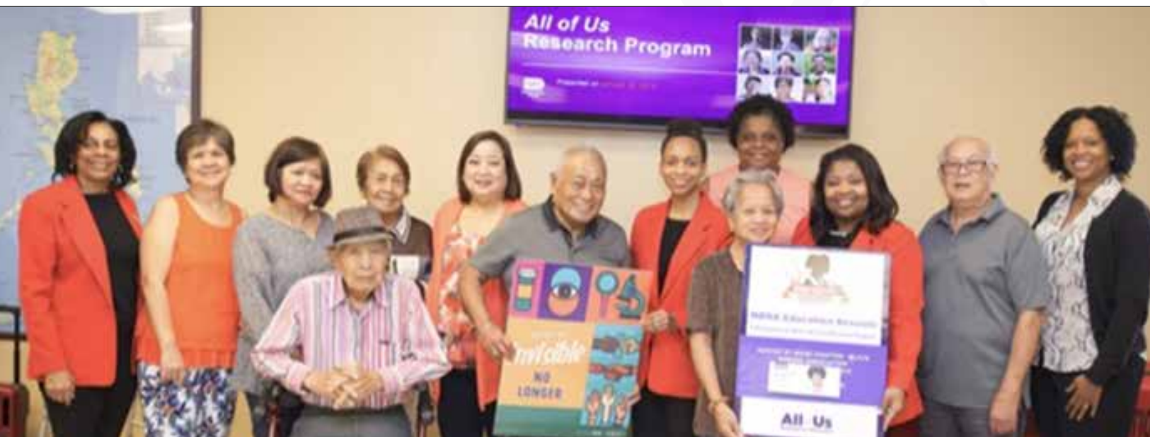
Miami BNA BOD Members along with Community Members at the NANAY Community Center.