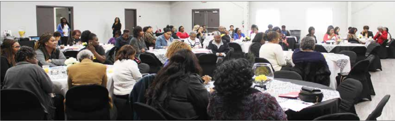
Individuals look on during All of Us Presentation.