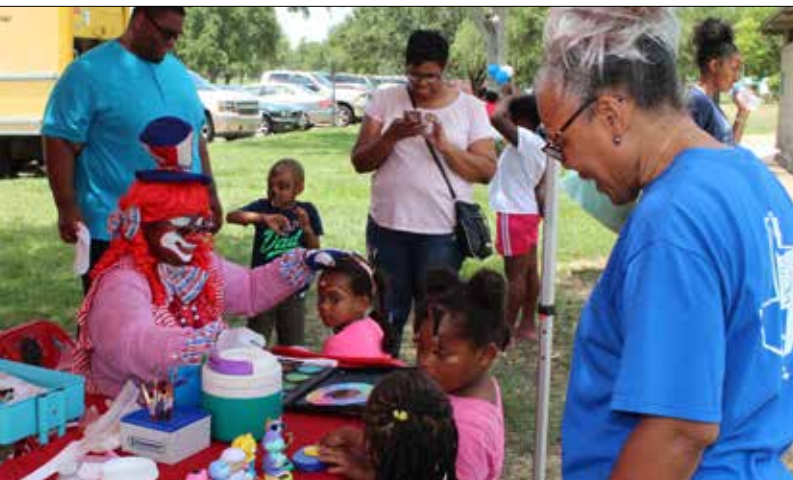
Ber Ber facepaints