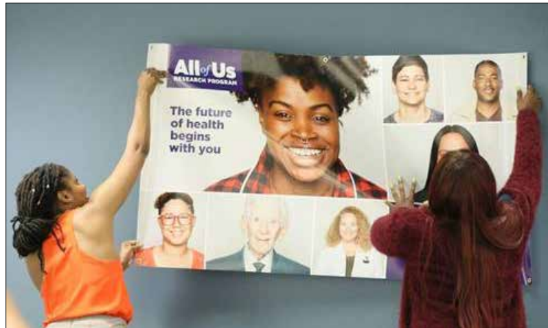
Setting up for the UMSON event