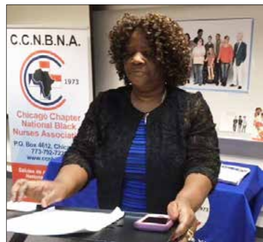
Live Power Point Presentation of All of Us Research Program